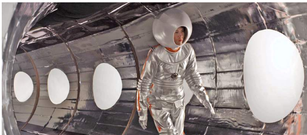
Ming Wong, Windows On The World (Part 1), 2014. Mixed media installation featuring a single channel video.

Saturday October 31 & Sunday November 1 are full throttle FIELD MEETING Take 3: Thinking Performance forum days. Day 1: 10 AM – 6 PM , hosted at The Metropolitan Museum of Art's Bonnie J. Sacerdote Lecture Hall and Day 2: 10 AM - 5 PM , at Hunter College Art Galleries, Downtown- 205 Hudson Street. Space is limited and registration for arts professionals and critics is required here.