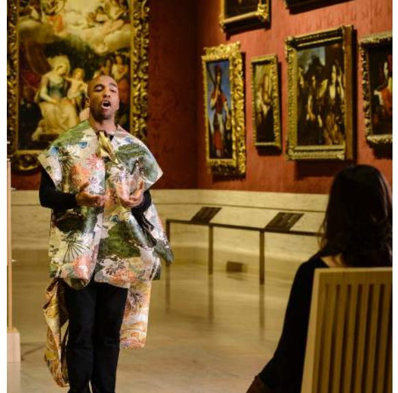
Lee Mingwei, Sonic Blossom , 2015. Performance view from The Museum of Fine Arts in Boston.

In addition to Sonic Blossom , ACAOW presents FIELD MEETING Take 3: Thinking Performance , an exclusive two-day art forum for artists and arts professionals focusing on creative process, conceptual exchange, experimentation and collaboration. Conceived and curated by Leeza Ahmady , Independent Curator and Director of ACAOW, FIELD MEETING: Thinking Performance foregrounds the multiplicity and critical role of performance work coming out of the context of Asia with performances, talks and discussions by over 30 compelling creative minds—renowned and up-and-coming artists, writers, curators, and arts practitioners. By spotlighting individual practices and dynamic relationships with historical discourses and social and political conditions, FIELD MEETING: Thinking Performance invites broader, more nuanced interpretations of performance work and fresh understandings of performativity in artistic production. Keynote presenters include: New York Times art critic Holland Cotter , Director and Curator of the Witte de With Center for Contemporary Art in Rotterdam, Defne Ayas , and Singapore-based artist Ming Wong .