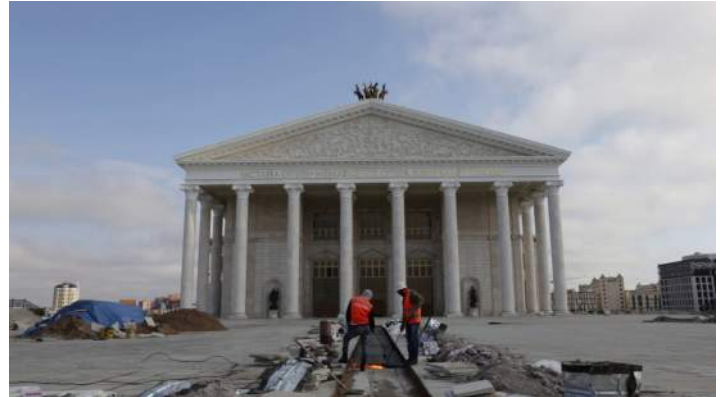
Earth & Shape, 2013-2015, single-channel video, color, sound, 16:47 min