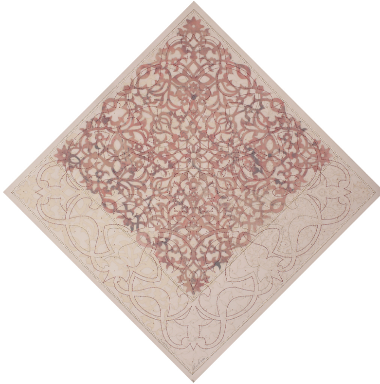
Anila Quayyum Agha, I Will Find the Flowers .