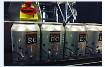
This Week in Food: Shake Shack Run, A Square Meal, and Beer Trolley 3.0