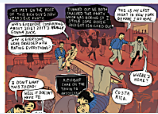
Cartoon: Normel Person