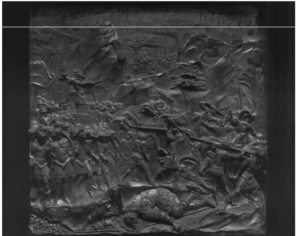
Gates of Paradise 9 - David, 2016, by Hiroshi Sugimoto, gelatin silver print. © The artist

Sugimoto's imposing black and white photographs, often shot from below to suggest the smallness of mankind, will be presented alongside Japanese nanban masterpieces from the 16th and 17th century – a style of East-West hybrid art, produced in Japan following exposure to traders and missionaries from Europe, in particular from Portugal. Other works date back as far as the 13th century.