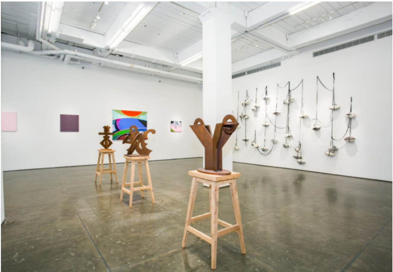
Installation view, Referencing Alexander Calder: A Dialogue in Contemporary Chinese Art, courtesy Klein Sun Gallery. Photo by Drew Dies.

When the Klein Sun Gallery first opened 10 years ago, its inaugural show also revolved around Calder, though it focused more on his influence on his Western artists.