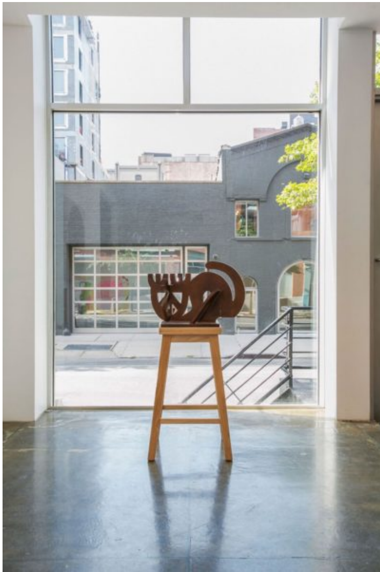
Installation view, Referencing Alexander Calder: A Dialogue in Contemporary Chinese Art, courtesy Klein Sun Gallery. Photo by Drew Dies.

Referencing Calder's stabiles are several steel sculptures by Huang Rui are connected to Calder's steel sculptures and include two abstract representations of animals entitled Monkey and Cat .