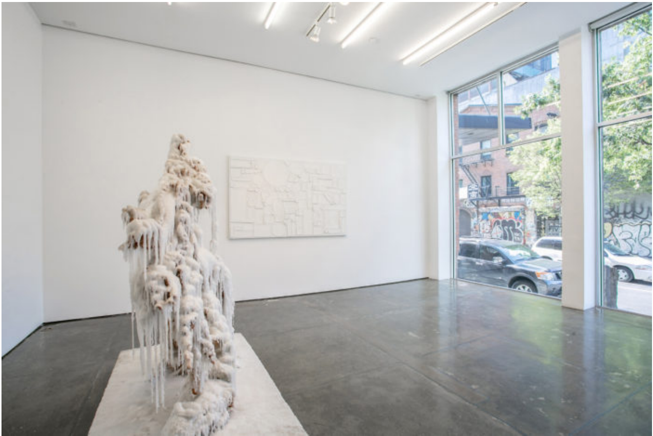
Installation view, Referencing Alexander Calder: A Dialogue in Contemporary Chinese Art, courtesy Klein Sun Gallery. Photo by Drew Dies.

A couple of pieces that convey the concept of flow are a dynamic wax sculpture by Yangjiang Group entitled Flight of Dragon and Dance of Phoenix , and a painting by Shen Fan entitled Shan Shui C-27 which has a calming effect as it features a mountain and a wave of water depicted with thin black strokes of paint and illustrating the relationship between solidity and movement.