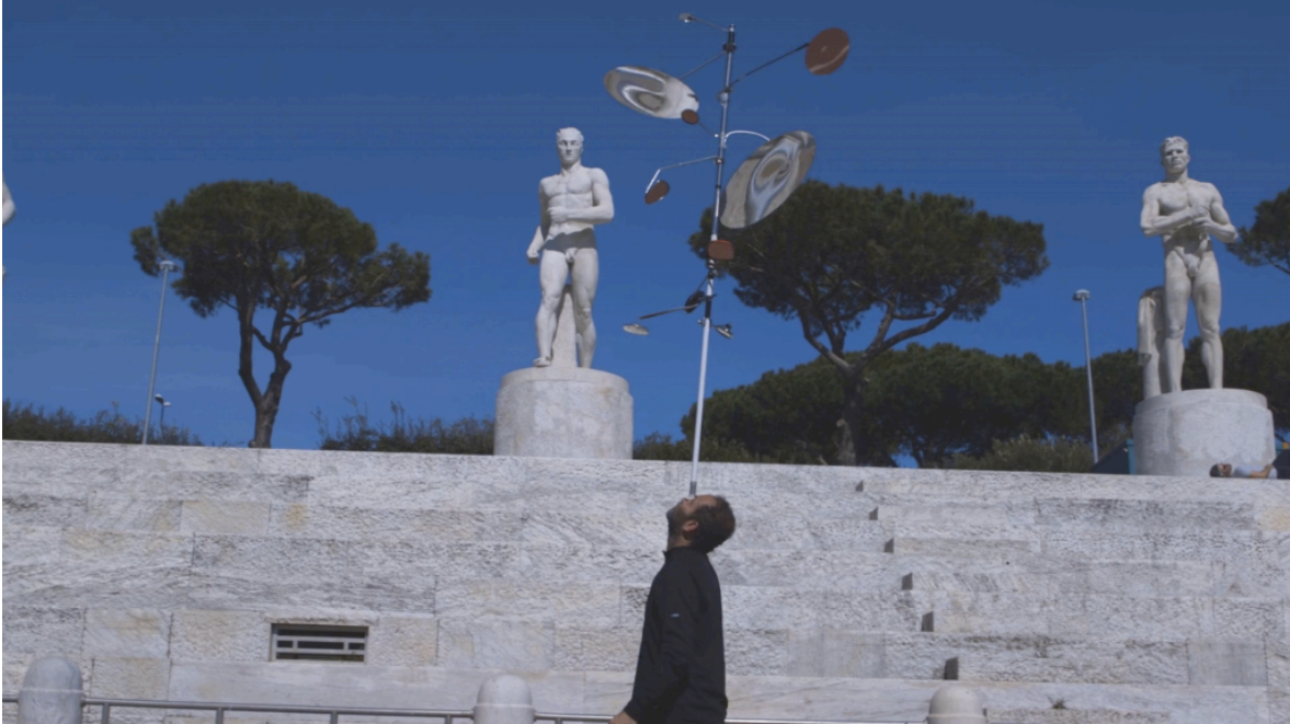
Hiwa K, Pre-Image (Blind as the Mother Tongue) , 2017, HD video, color, sound, 17_40 minutes.

open to the public, particularly school children that are invited to attend workshops, performances, and exhibition tours. Although recent editions of the biennial have reflected the strengths and weaknesses of their respective curators, the foundation has maintained an active role in setting the tone of its overall program.