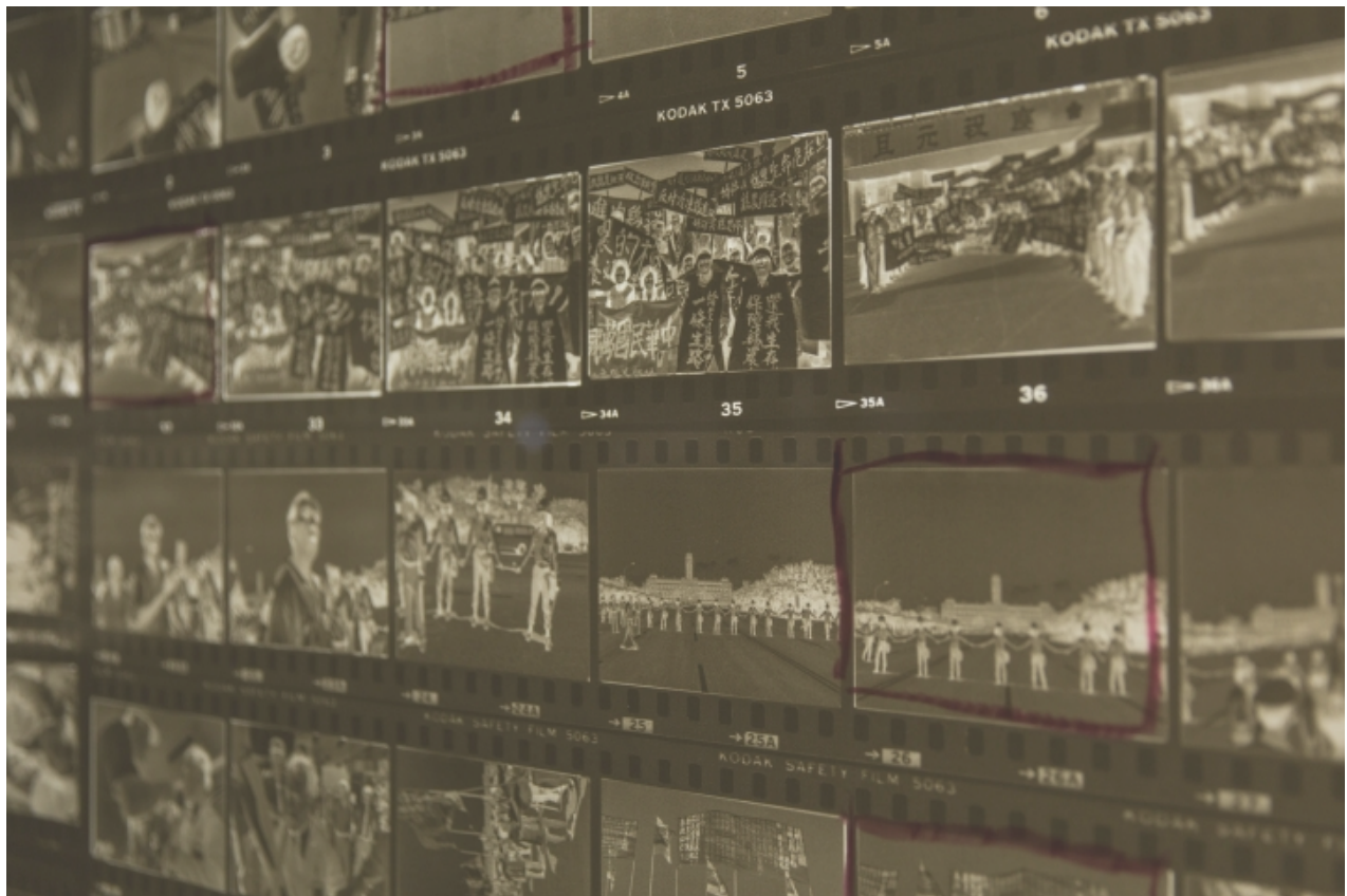
Exhibition view of "History's Shadows and Light" at the Taipei Cultural Center

The exhibition begins on the first floor, with Green Team's camcorder videos of events, including crowds calling for the first free legislative elections in 40 years (1987), a bloody clash at a gathering for peasants' rights (1988), and a protest against the Civil Associations Act, which banned organizations from advocating for independence and even using "Taiwan" in their names (1989).