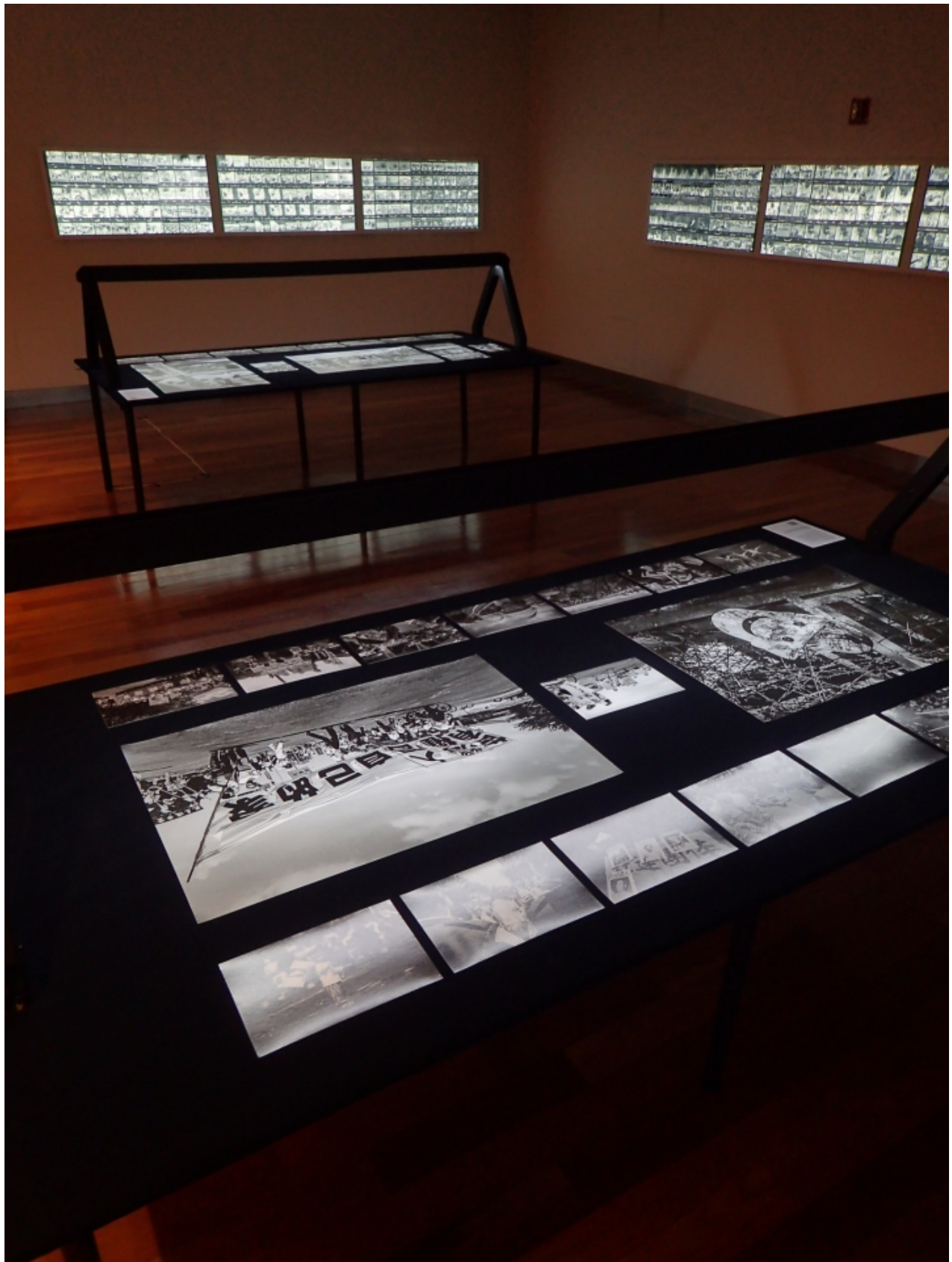
Exhibition view of "History's Shadows and Light" at the Taipei Cultural Center

History's Shadows and Light at the Taipei Cultural Center picks up in 1986, in the lead-up to the lifting of martial law in Taiwan on July 15, 1987. After almost four decades of the KMT's one-party authoritarian rule, with its suppression of freedom of speech and assembly and its blacklist of political dissidents, an opposition party took shape — the Democratic