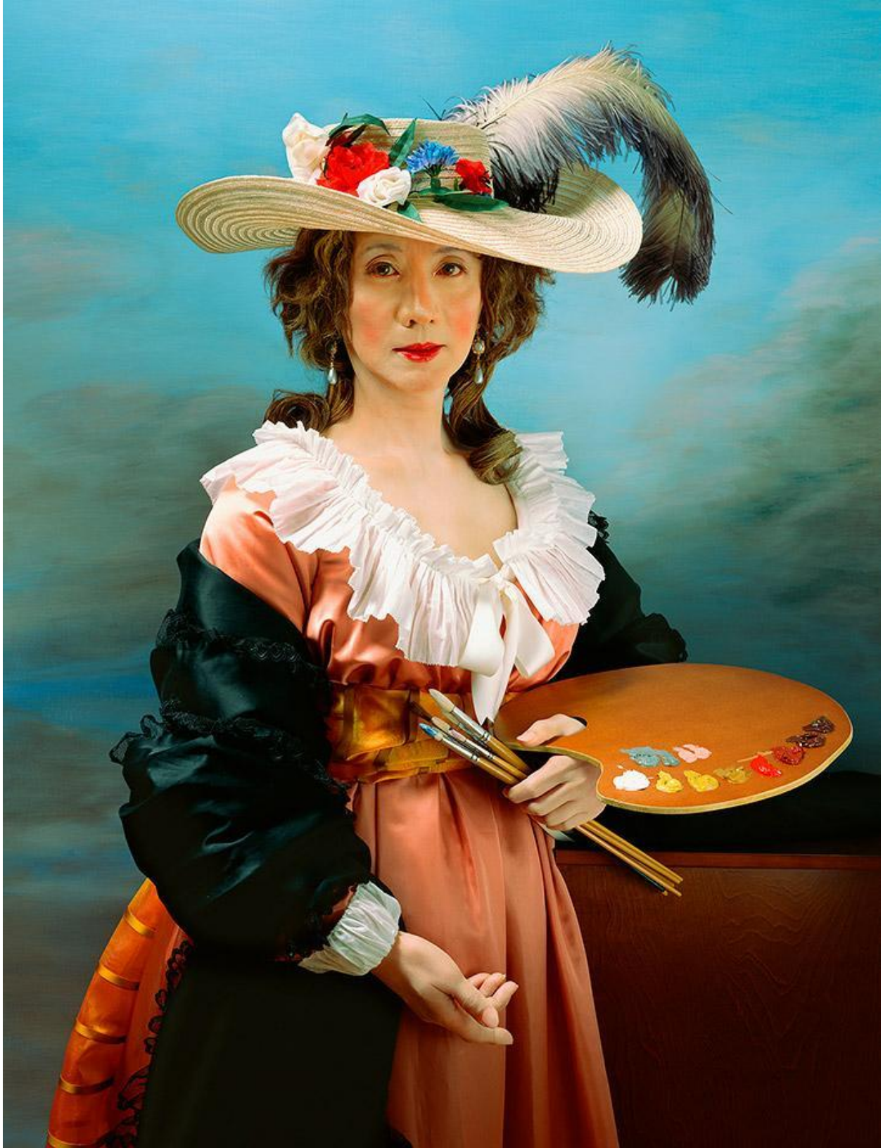
Self-Portraits through Art History (Le Brun on the Witness Stand), 2016, by Yasumasa Morimura. Courtesy of the artist and Luhring Augustine, New York.