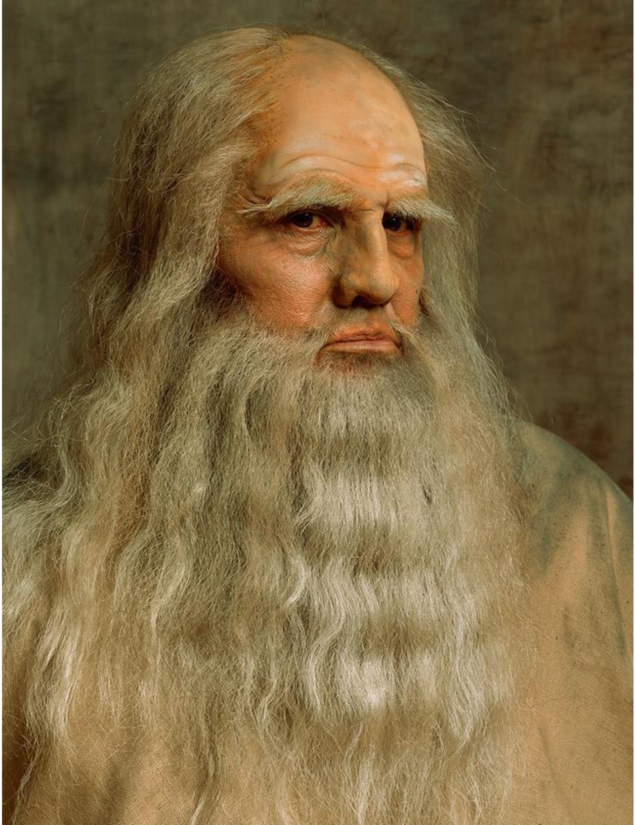
Self-Portraits through Art History (What Leonardo's Face Says) , 2016, by Yasumasa Morimura.