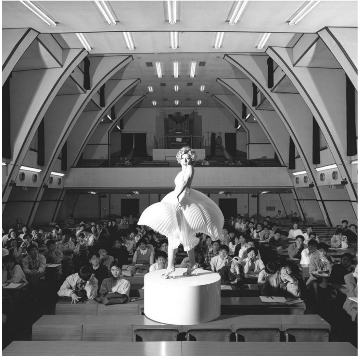
Self-Portrait (Actress) / Marilyn at Tokyo University, Komaba, 1995–2008, by Yasumasa Morimura.