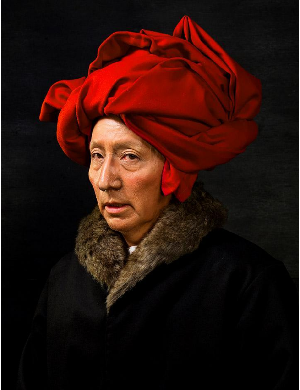
Self-Portraits through Art History (Van Eyck in a Red Turban), 2016, by Yasumasa Morimura.