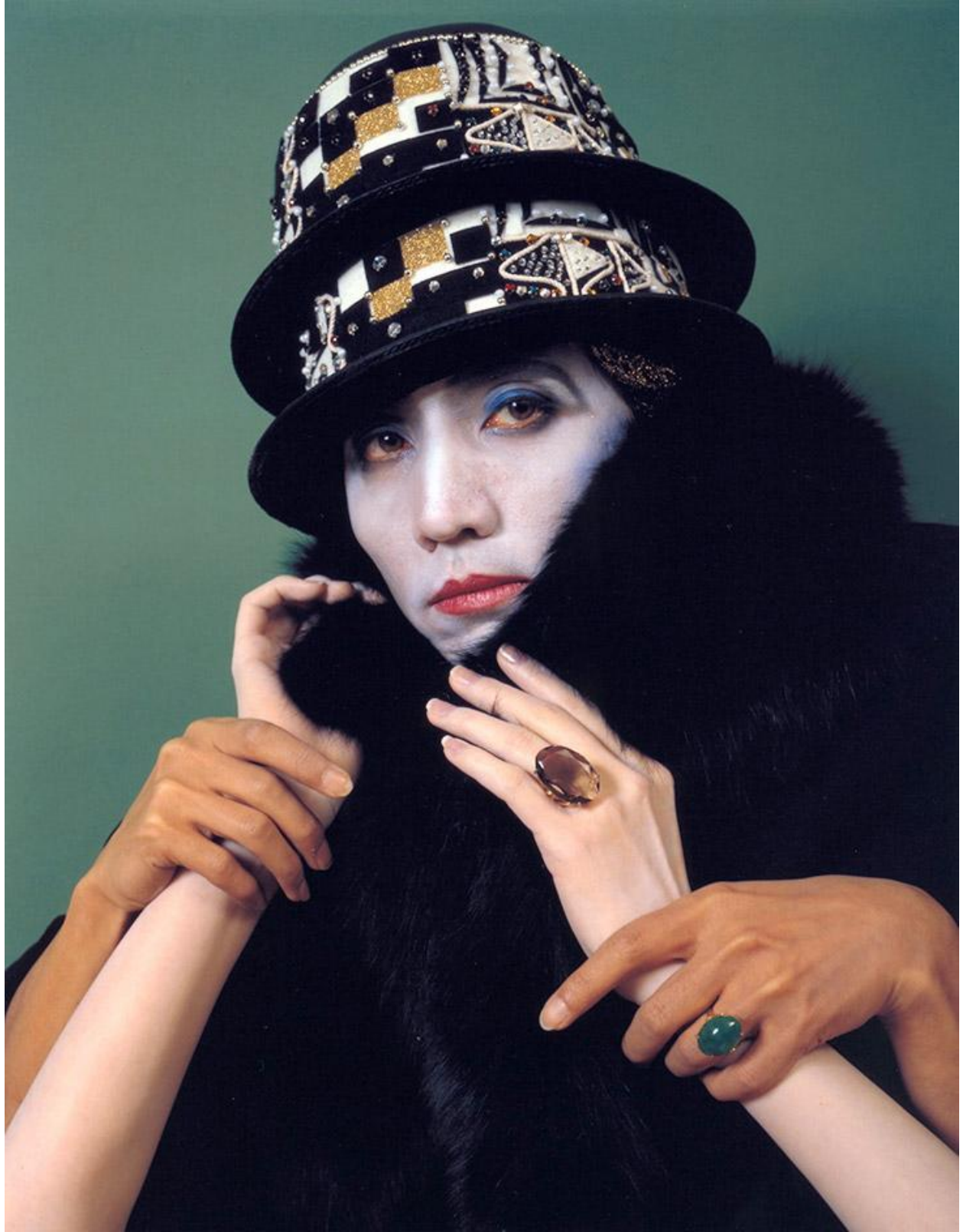
Doublonnage (Marcel) , 1988, by Yasumasa Morimura. Courtesy of the artist and Luhring Augustine, New York. © Yasumasa Morimura